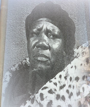
Rain Queen Modjadji